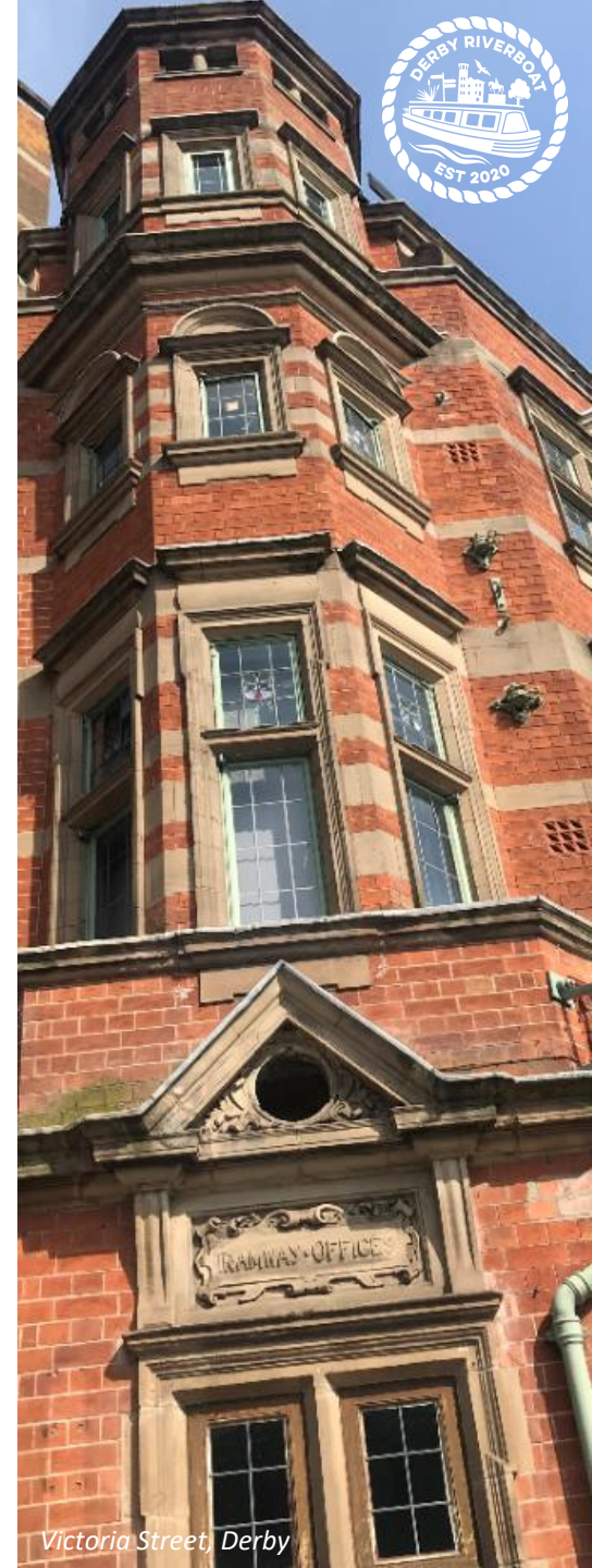
Victoria Street, Derby