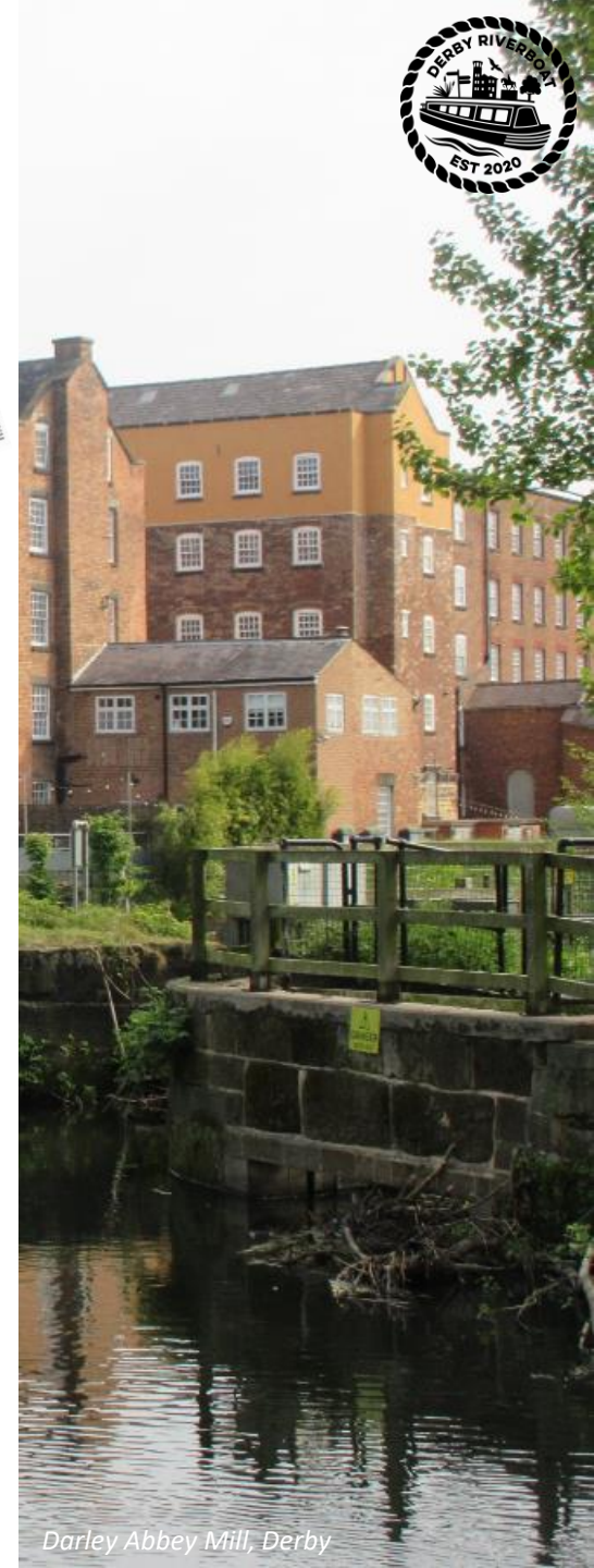
Darley Abbey Mill, Derby

ALL WEATHER CRUISING: Passengers can choose between indoor and outdoor seating areas. So whether you decide you want to relax in the fresh air on the foredeck on a hot and sunny day or retreat to the covered, warm cabin when it's cooler the choice is yours. All areas of the boat are fully accessible to wheelchair users.