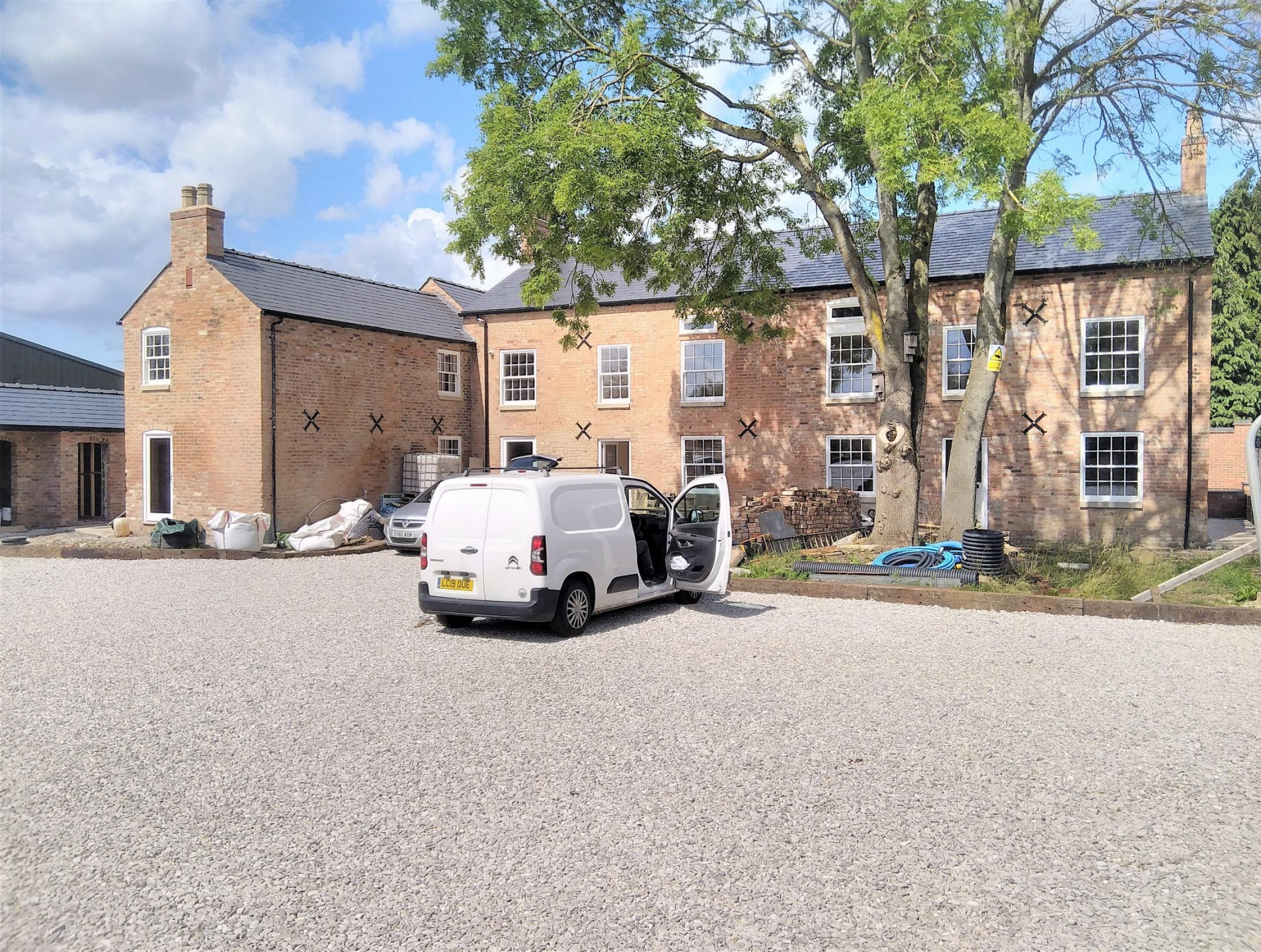
Cottages Development in August