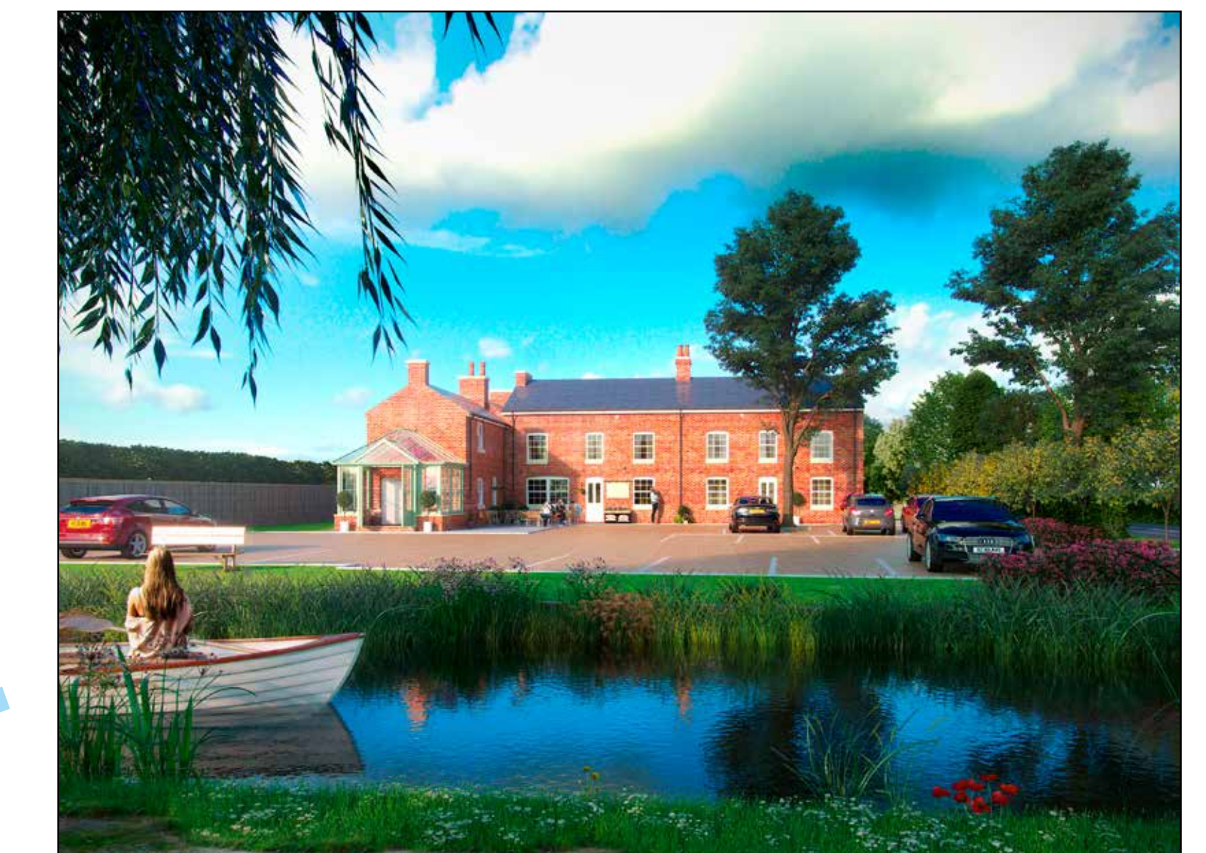
Canal Cottages Hub

Once complete the canal will be available for angling, canoeing and other outside activities. This will be supported by a café and other facilities at the Canal Cottages, which should also be completed in 2021.