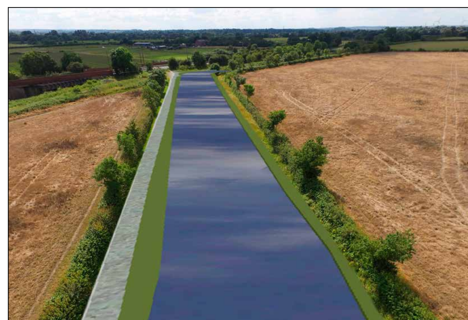
Artist impression of restored canal